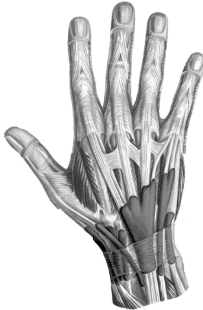
Dorsal synovial sheaths of right hand

Task 9: Indicate the muscles, which belong to the tendons passing through the canals shown in the picture, and write their names.