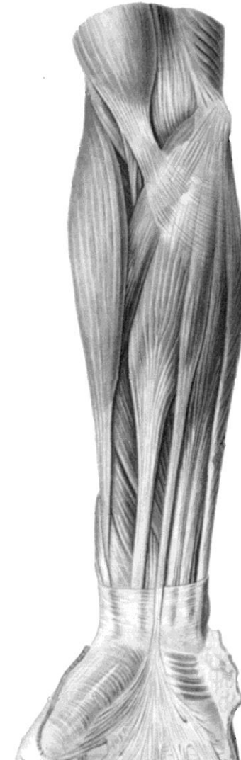
Muscles of forearm (anterior aspect)