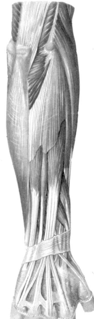
Muscles of forearm (posterior aspect)

What is the general action of the posterior antebrachial muscles?